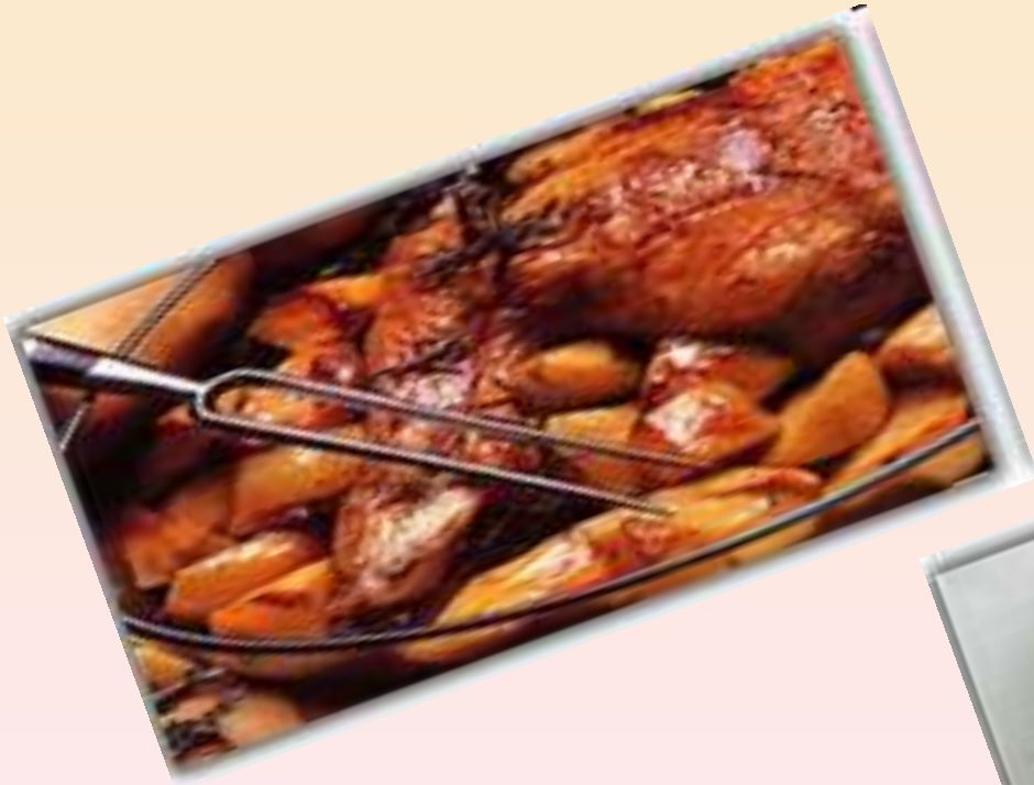
Baked Lamb - Agnello al forno