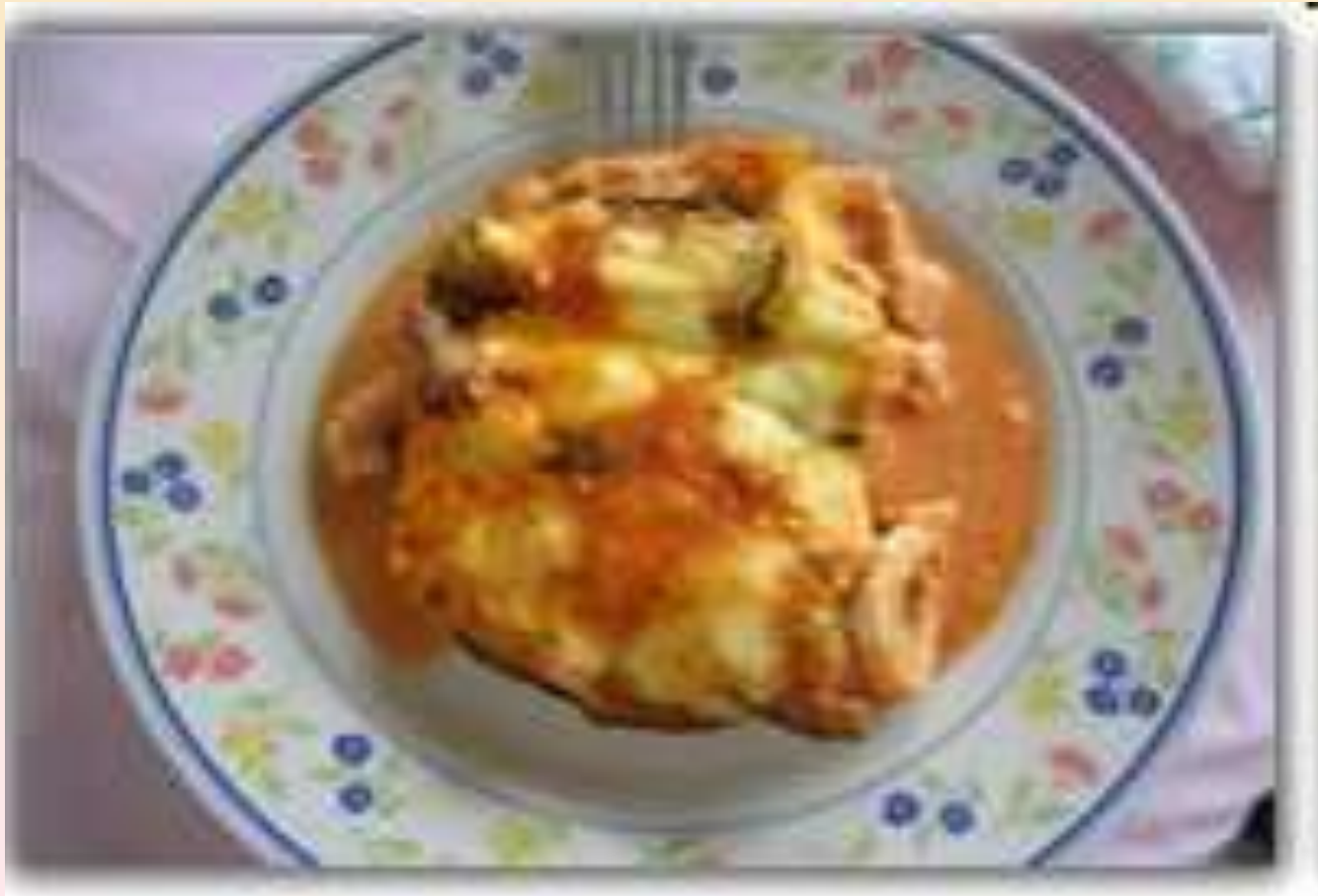
"Olivetana" Tripe - Trippa all'olivetana