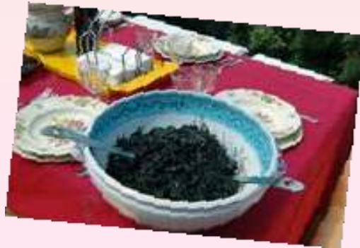
Pasta with cuttlefish ink sauce