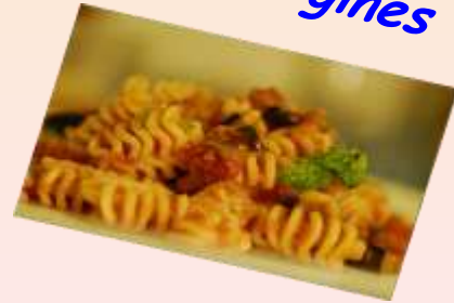
Pasta with swordfish and aubergines