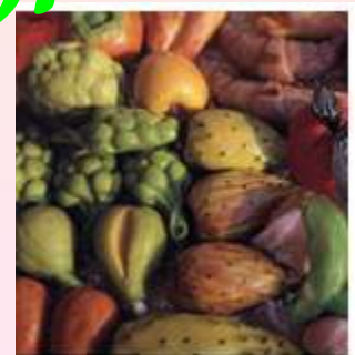
Martorana Fruit (Pasta Reale)