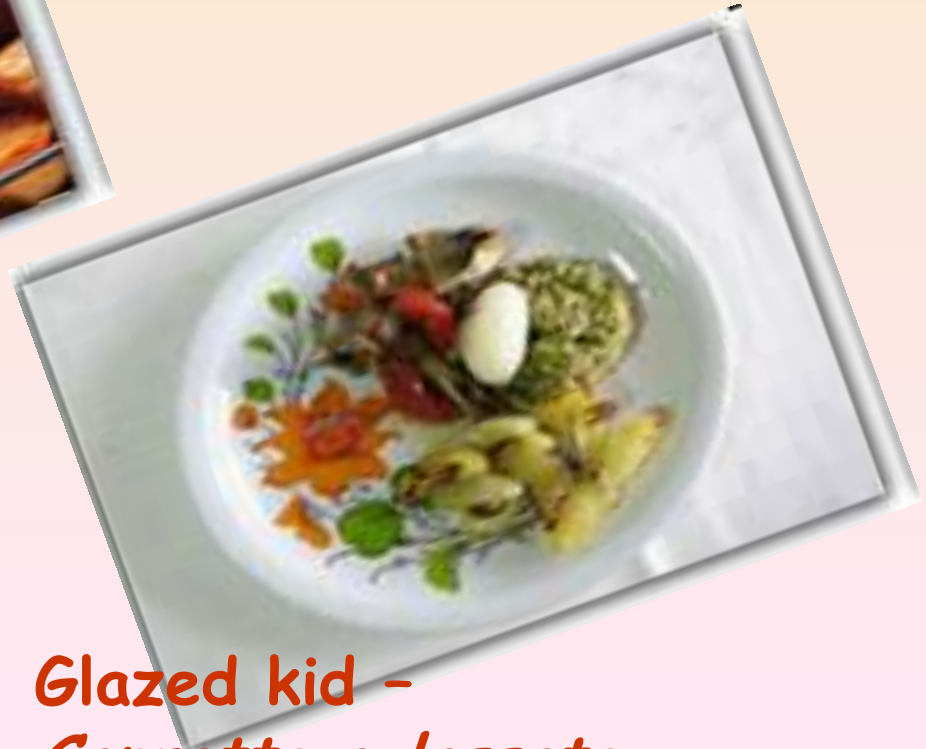
Glazed kid - Capretto aglassato