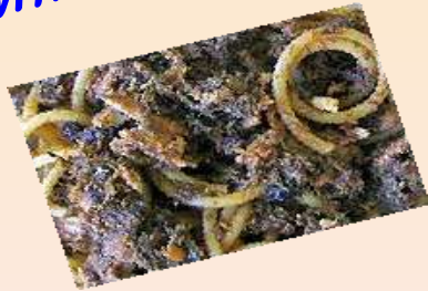
Pasta with fennel and sardines