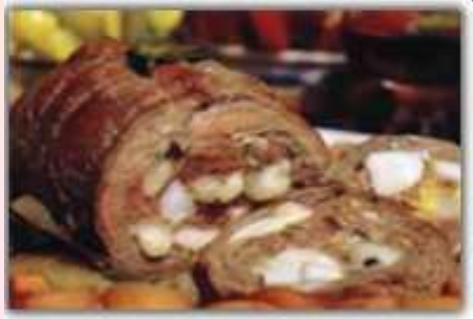
Cut of rump of veal with meat sauce Falsomagro al ragù