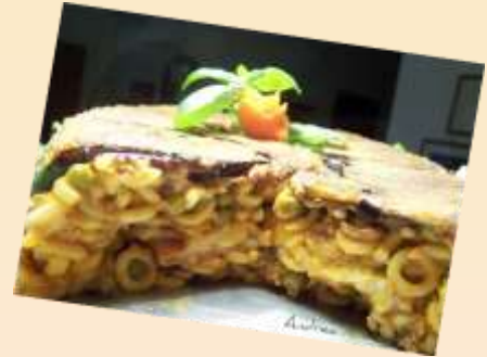
Pasta with swordfish and aubergines