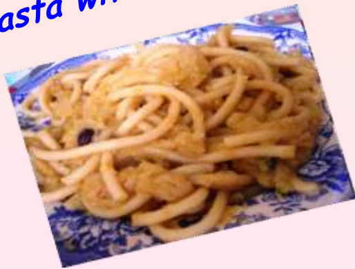
Pasta with cauliflowers