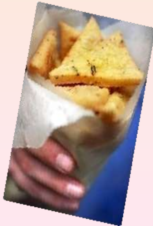
chick-pea fritters (panelle)