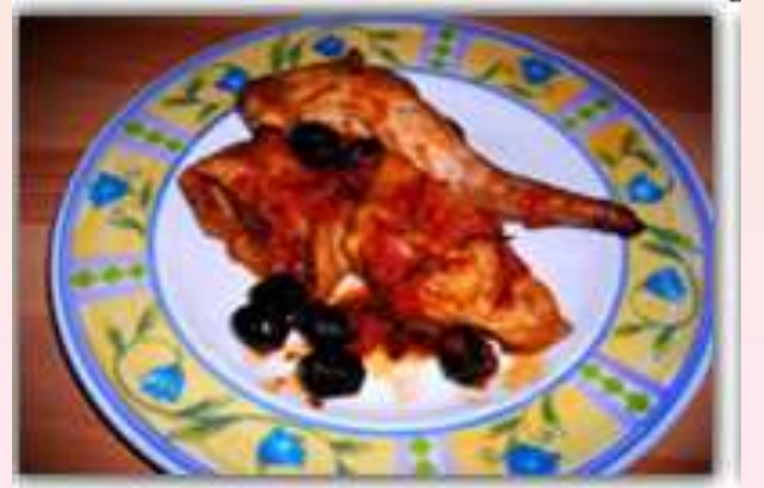
Sweet and sour rabbit Coniglio all'agrodolce