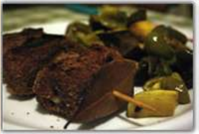
Sicilian Roulades Involtini alla siciliana