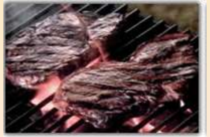
Barbecued Mutton Castrato alla brace